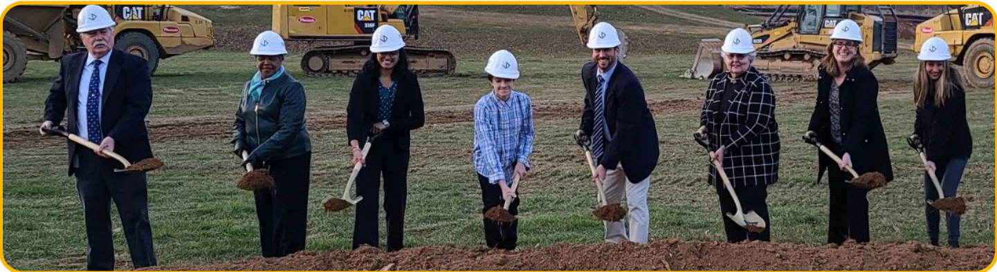
Board of Education members took part in the groundbreaking for the new East Middle School replacement project.