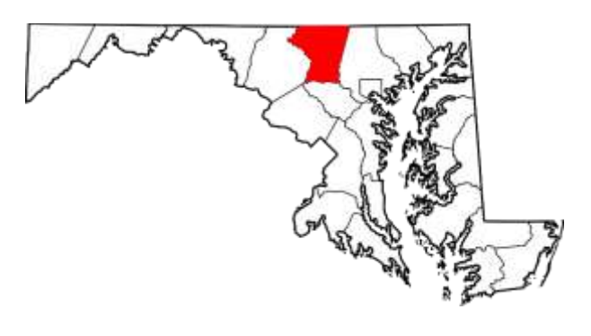
Figure 1. Map of Carroll County in Maryland

The unemployment rate has increased steadily from 2.8% in 2011 to 3.3% in 2012 and 3.6% in 2013.