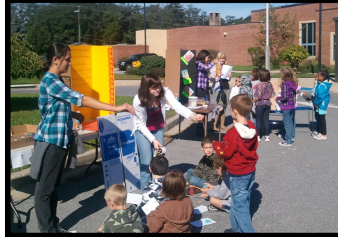
Students participating in "Farm to Table" program at Taneytown Elementary on September 16, 2011.

PLEASE, no outdated cans. Thank you, Kid Helping Kids.