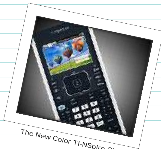
The New Color TI-Nspire CX!

Please contact us through email or by calling the school (410-751-3320) if you have any questions or concerns, or just to touch base. We are looking forward to working with you and your student to be successful in math!